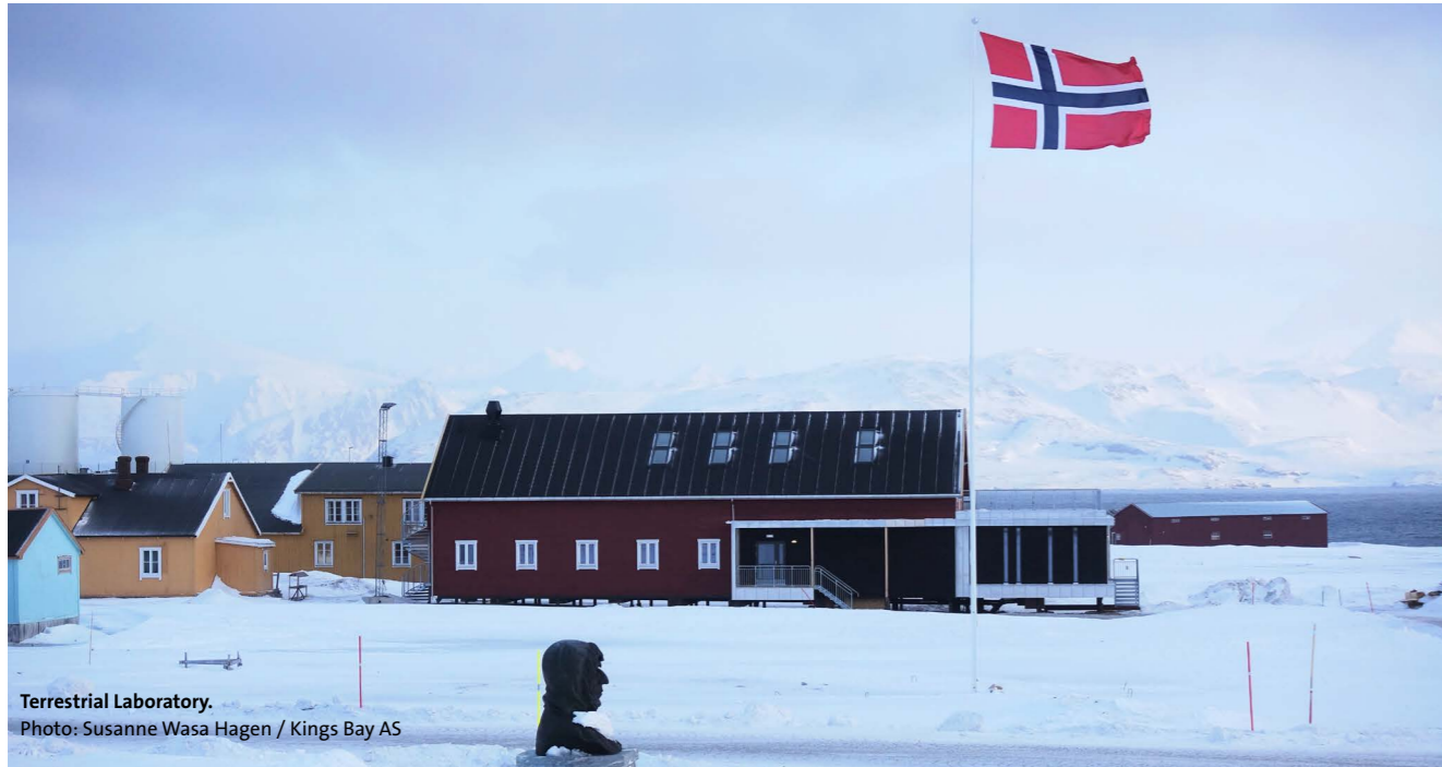
Terrestrial Laboratory.

SSF stimulates cooperation and collaborative efforts between all research communities in Svalbard and within all research disciplines. SSF facilitates the RiS-portal (Box 2) for sharing information regarding research projects being conducted anywhere in Svalbard, including the four permanently manned research communities in Svalbard (Ny-Ålesund, Longyearbyen, Barentsburg and Hornsund). The RiS-portal is a unique tool for information exchange and for enhancing cooperation and coordination.