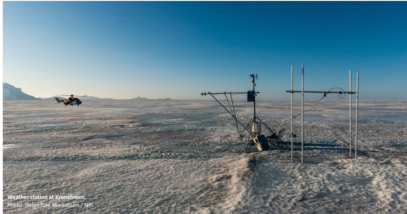
Weather station at Kronebreen.