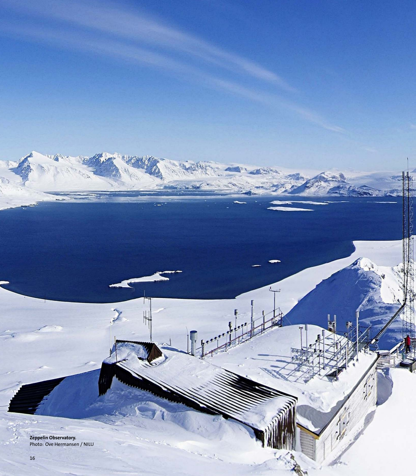
Zeppelin Observatory.