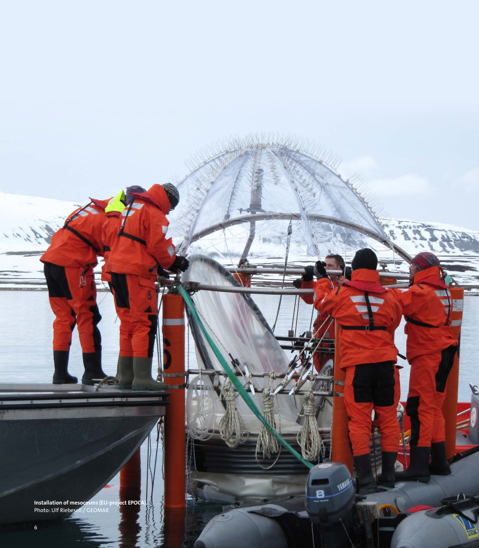
Installation of mesocosms (EU-project EPOCA).