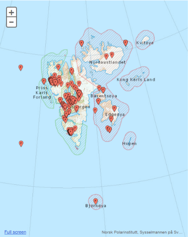
Map: 310 active fieldwork locations today